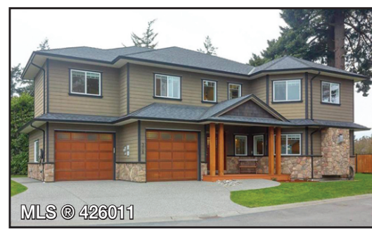
COLWOOD SUPERSTAR $999,999

Spectacular townhouse with double garage. The views are incredible from this 3000 sq ft luxury home at the gated Wedgewood Estates! 3 bedrooms, 3 bathrooms + large den, and no shortage of storage. Well-appointed offering 2 living rooms with fireplaces, studio/hobby room, formal dining room, eat-in kitchen, wet bar, and plenty of room for guests and entertaining. Many upgrades including ductless heat pumps, updated kitchen with s/s appliances, new flooring, paint etc. Stunning views of Telegraph Cove and the San Juan Islands!