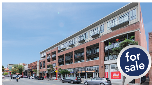
STYLISH CONDO IN THE HEART OF VICTORIA! 516 – 517 Fisgard Street $495,000