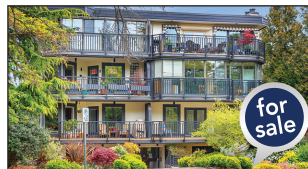
FANTASTIC FAIRFIELD LOCATION! 201-906 Southgate Street $549,000