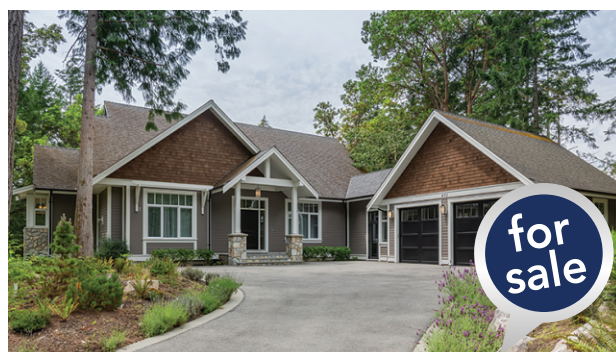
SPECTACULAR HOME ON 2.5 ACRES! 491 Dunmora Court $1,970,000

Let us arrange a private viewing for you! INFO@MADSENLANGLIOS.COM