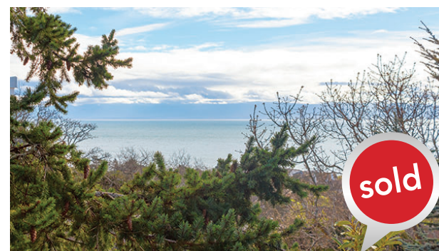
RARE GONZALES HILL OPPORTUNITY! 220 Denison Road $1,300,000

Let us arrange a private viewing for you! INFO@MADSENLANGLIOS.COM