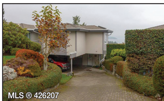
10 MILE POINT OCEAN VIEWS $875,000

Stunning ocean view lot ready for your dream home! Fully serviced and price INCLUDES GST. This is the only lot for sale in the area. Close to the village shops, restaurants and bus routes. Call for full details.