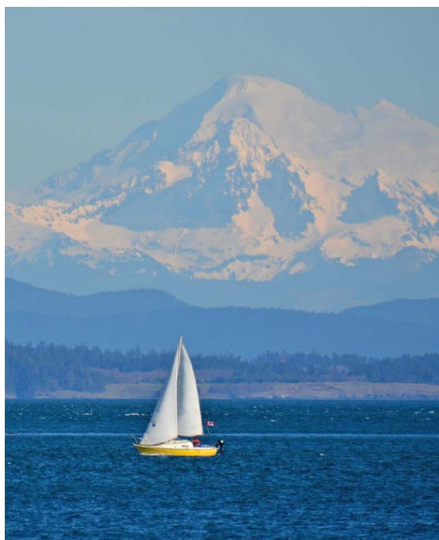
Sailing in Oak Bay with Mt. Baker WA.

Welcome to Oak Bay, home to just over 18,000 people living along the Salish Sea. A residential community a few minutes from downtown Victoria, Oak Bay's business core is located along Oak Bay Avenue, with several smaller villages in the Estevan neighbourhood and along Cadboro Bay Road.