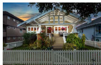
Moss Street Bungalow