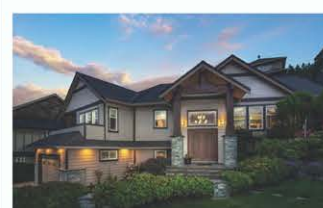
Elegant Resort Style Living