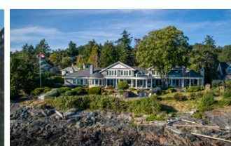
Hamptons Style Estate