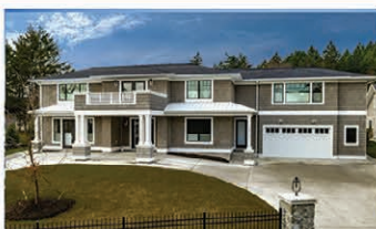
Executive Oceanview Home

10812 Madrona Drive $2,750,000 COMING SOON