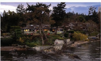
Oceanfront in North Saanich

3350 Upper Terrace Road $2,695,000 MLS 402208