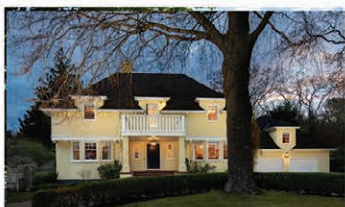
Victoria Character Manor

3350 Upper Terrace Road $2,695,000 MLS 402208