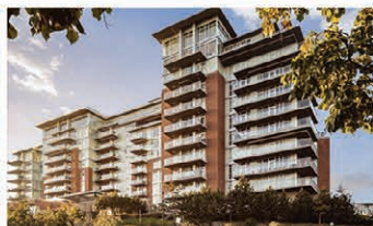
3 Bedroom @ Bayview One

10712 Bayfield Road $2,295,000 Exclusive Listing