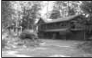
SHAWNIGAN LAKE $399,998

Your family will thrive in this excellent 3 BR home on a superb .42 acre treed lot in Shawnigan. This home has a beautiful new kitchen w/ large cooking island and professional grade stainless appliances and sliders to a large deck. Modern main bath, master is a harmonious hideaway and 2 BRs up are colourful and ready for the kids. A pellet stove keeps the large LR toasty warm and the Maple floors shine. Downstairs, a large family room is cozy with a woodstove, cork flooring and built-ins for games and toys. An additional craft room with more built-ins leads to a 3 pce. bath w/ shower and could make a great master suite. Oversized single car garage offers extra storage. Step outside to the stone patio and hydrotherapy hot tub. MLS 281269.