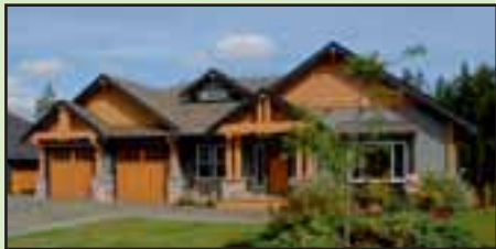
613 Sentinel Drive $699,000