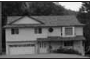
New ML 281501 $359,900

SHAWNIGAN SLEEPER Drive a little and look what you can buy! A 1994, 3 BR, 3 bath home, 1934 sq.ft. finished - on two levels plus full storage in walkout lower level! New roof in '07, family room, hobby room, double garage, back-deck, nice lot on a quiet cul-de-sac close to Shawnigan Village and the lake! This one is priced to sell - call now!