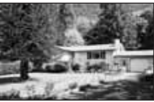
COWICHAN LAKE BEACH ACCESS FOR $284,900 Very well maintained Cowichan Lake, 3 BR, 2 bath home steps away from beautiful beach access. MLS 279788.

Sue Lyle Sherry Kayra DFH Real Estate Ltd. 250-743-7151