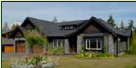
619 Sentinel Drive $689,000