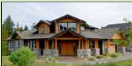
625 Sentinel Drive $679,000