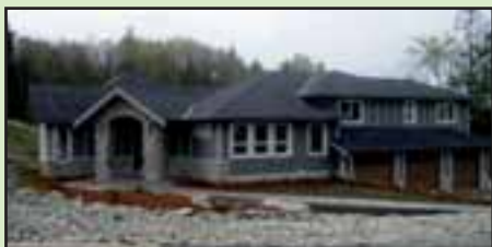
2369 Coopers Hawk Rise $799,000