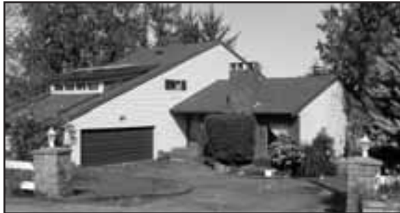
New ML 281857 $509,800

Open House Sat 2-4 771 Aros Rd Cobble Hill