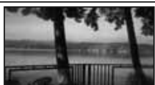
5753 Sooke Road

oak floors in main living areas & walls of ocean view windows. LR w/pine vaulted ceiling, floor-ceiling granite FP & sliders to full-length 500+sf stamped concrete ocean & mtn view patio. DR w/woodstove opens to patio. Euro style kit has w/i pantry. MBR has w-i closet, 4pce ensuite & sliders to patio. Lower level w/family room. Dbl garage. MLS275605.