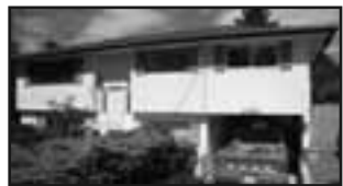
2383 Church Road

Beautifully finished 2009, 2BR, 2BA, ground floor strata duplex w/ocean views. Open-concept 22'x14' living/dining area w/laminate floor & sliders to ocean view patio & gardens. Maple kitchen w/dbl ss sinks, b/i MW & DW. Main 4pce BA w/slate tile floor. 2 BRs incl MBR w/2pce ensuite & ceramic floor. Landscaped yard w/garden beds, shrubs, flowers & cascading window boxes. NHW & no strata fees. Possibly Sooke's Best Buy. MLS 279406.