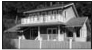
8590 West Coast Road

LR w/brick FP, open beam ceiling & picture window views. Oak country kitchen w/bay window eating area & door to deck. Formal DR too. MBR has w/i closet, ensuite BA & a bay window framing ocean & Olympic Mtn views. Garage w/shop area + RV pkg. Yard w/pond, beautiful rockwork & paths winding thru spectacular gardens. MLS 280926.