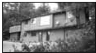
2368 French Road

more BRs & laundry/storage. Single garage + RV pkg. Recent updates including BAs, flooring including ceramic tile, laminate & new carpet in BRs. Freshly painted, new light fixtures & interior doors. MLS 275689.