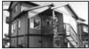
6531 Lanark Road