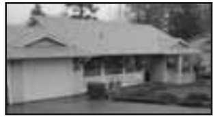
6778 Foreman Heights Drive

FP. DR opens to huge 33sf partly covered wrap-around deck. Bright kitchen has eating area & also opens to deck. MBR w/ensuite BA. Storage rm/shop & carport. Large, level, sun-drenched, SW-facing, landscaped.17ac w/fenced & gated backyard & a variety of flowers, mature shrubs & fruit trees. MLS 281087.