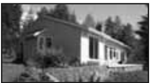
2601 Seaside Drive

fresh designer paint. Open concept LR & DR w/walls of windows, propane FP & island kit. MBR has w/i closet, b/i dressers, soaker tub & French doors to huge ocean view deck. Sunny, s-w facing, fenced, gated, landscaped, 3 decks, pond & trails thru forest to horse stable/paddock. MLS274265.