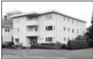
OAK BAY OCEAN VIEW $249,000