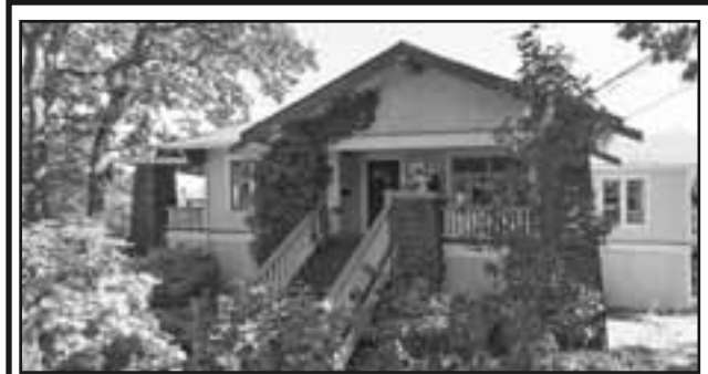
OPEN HOUSE SUNDAY FROM 2-4PM 2407 Estevan Avenue

This beautiful Wallace P. Latimer 1913 Arts & Crafts 5 bedroom 2 bathroom house has been lovingly maintained over the years and exudes charm as soon as you reach the front steps. Beautiful detailing inside includes original stained glass windows, built in cabinets with original hardware, all of the detailed finishings and gorgeous hardwood floors. The kitchen and bathrooms have been updated over the years so are very functional for today's families. Downstairs has been completely renovated with lots of space to enjoy for the larger family with separate entrance. This property is fully fenced with relaxing spaces including a side porch and also a back and side patio with fully landscaped private gardens. "Your Realtor for Life - Guaranteed Service & Results" Price $939,900