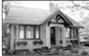
CHARACTER HOME PRICE REDUCED NOW $575,000