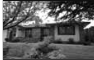
MINUTES TO EVERYWHERE!

This wonderful home is loaded with character and is located within walking distance of the shops and restaurants, plus there is the added bonus of separate studio/ workshop/ home office. Period features and modern updating makes this home a must to view - don't be disappointed by another sold sign - call me now! Peter Lindsay RE/MAX Camosun 250-744-3301