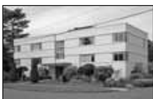
SOUTH OAK BAY 2 BEDROOMS $259,000