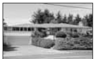
New ML 281823 $814,500 OAK BAY HOME NEAR UVIC