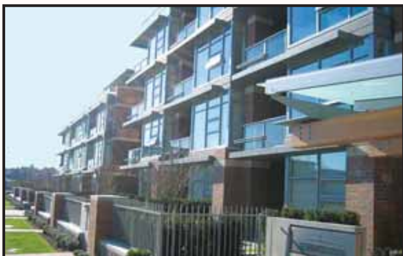
WEST COAST SOPHISTICATION...