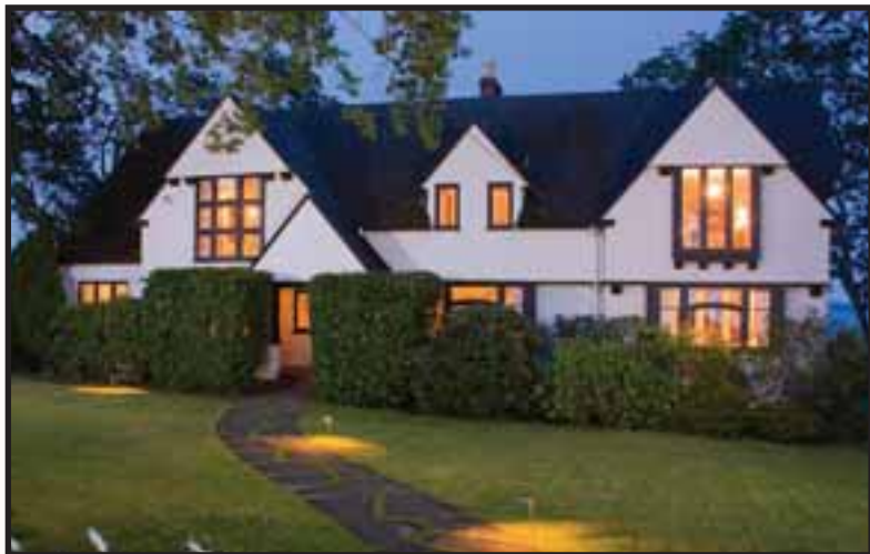
UPLANDS VIEWS 3605 CADBORO BAY ROAD, VICTORIA , BC

Greater Victoria's Real Estate Guide Since 1977