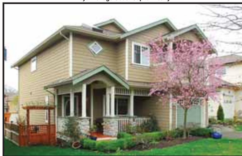
DON'T BEAT AROUND THE BUSH $588,000

Terrific 2002 3 BR, 3 BA plus den home. Open floor plan with vaulted ceiling in living room. Kitchen with super pantry, french doors to patio. *fenced yard & gardens. Ample storage in crawlspace. Central location - 10 to 15 minutes to everywhere. A wonderful private street of lovely homes!