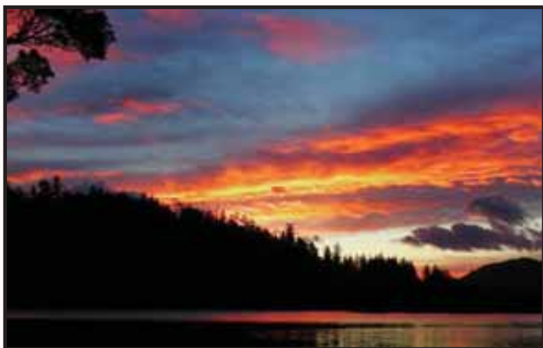
WATERFRONT... 5505 CROYDON $599,900

www.OliverKatz.com Royal LePage Coast Capital Realty