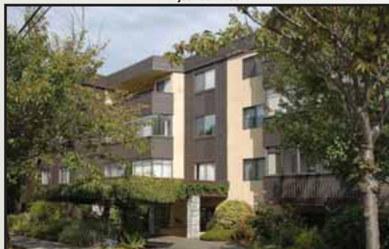
HEART OF FAIRFIELD $339,900

the Duttons Team www.duttons.com Duttons & Co. Real Estate Ltd. (250) 383-7100 (Toll Free: 1-800-574-7491)