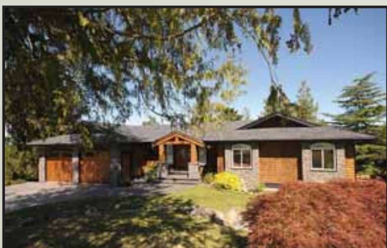
WEST COAST FAMILY HOME $1,479,000