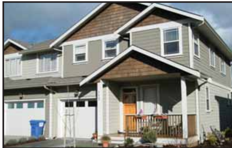
BETTER THAN NEW!!! 1733 SQ FT TOWNHOME ONLY $359,900