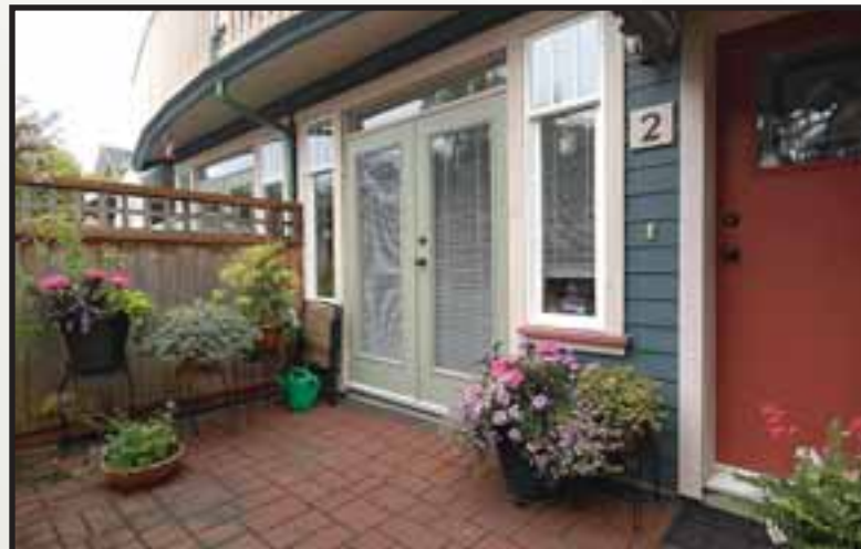
FAIRFIELD CONVERSION CONDO $329,000

Cozy 2 bedroom ground level 767 sq. ft. condo that has it's own sunny south facing entrance. 9' ceilings, electric fireplace. Built-in cabinetry & stained glass panels. Laundry in Unit. Fabulous Fairfield location near the water & other amenities. Character & low monthly assessment!