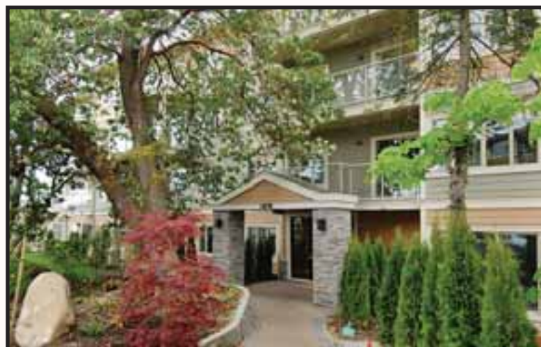
OPEN SAT & SUN 1-3 125 ALDERSMITH

The Duttons Team www.duttons.com DUTTONS & CO. REAL ESTATE LTD. (250) 383-7100 (Toll Free: 1-800-574-7491)