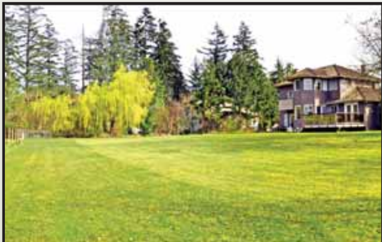
2 PRIME ACRES . BRENTWOOD BAY ..$995,000 ZONED RESIDENTIAL AND ON CITY WATER

Greater Victoria's Real Estate Guide Since 1977